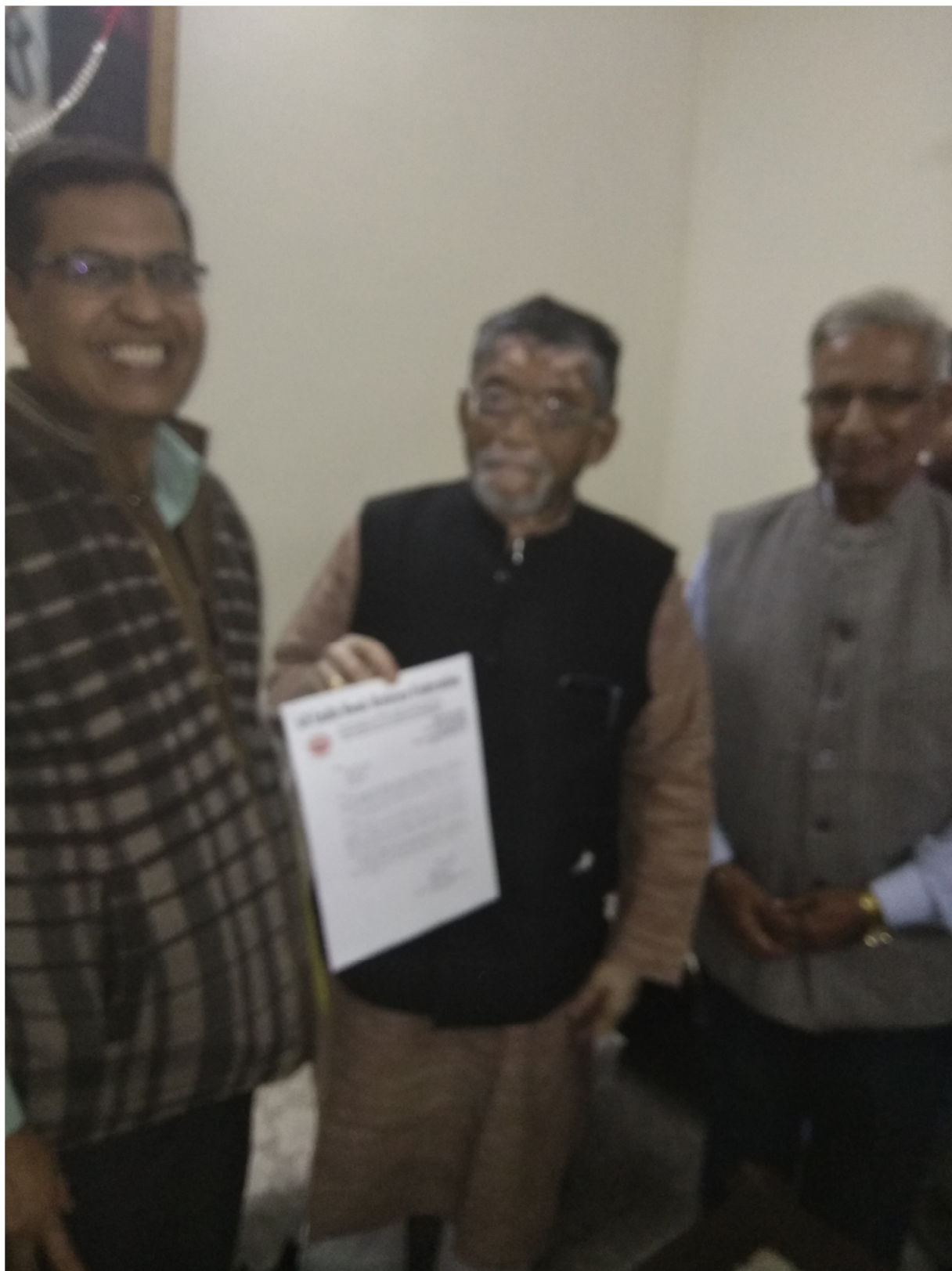
Aibrf delegation with Central Minister of state for finance Shri Santosh Gangwar