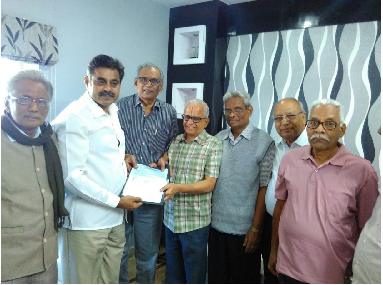
AIBRF DELEGATION WITH THE HONOURABLE M.P. SHRI Dr.Narasaiah Gowd