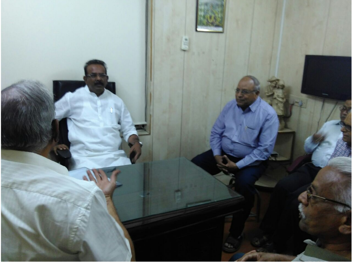
AIBRF , HYDERABAD WITH HONOURABLE M.P. Sri Visweswara Reddy(TRS)