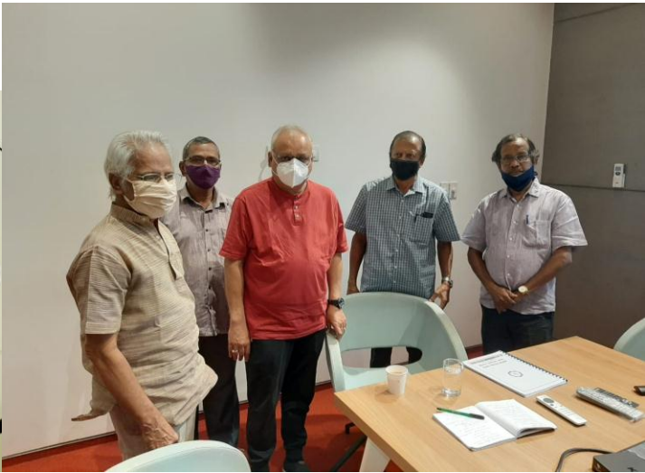
AIBRF delegation handing over memorandum MP Honorable Shri. M.V. Shreyams Kumar