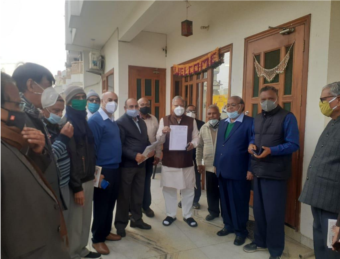
Photo of AIBRF delegation from Meerut submitting memorandum to Honorable Member of Parliament, Shri Rajender Agarwal on 06.01.2021

AIBRF delegation from Meerut met the honorable Member of Parliament ( LOK SABHA), Shri Rajender Agarwal and submitted memorandum to him on pending issues and requested him to write suitable recommendations to FM. He was kind enough to immediately send the letter to FM.