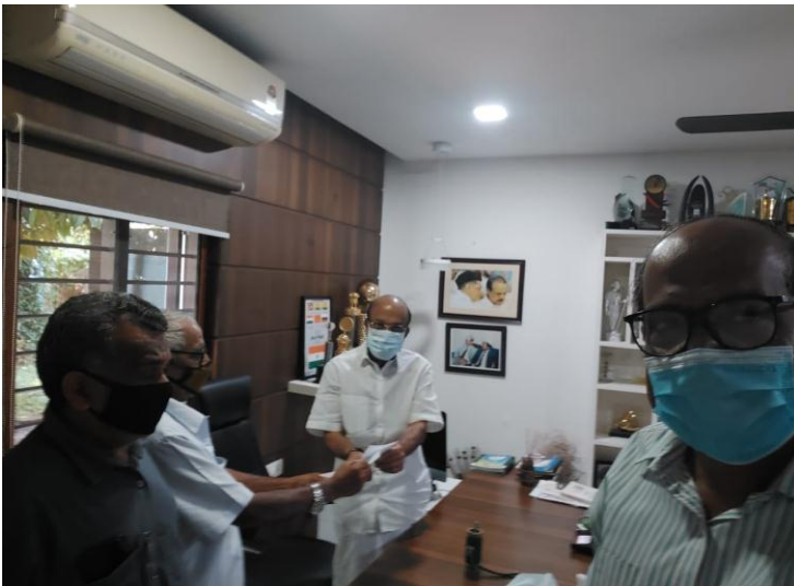
AIBRF delegation handing over memorandum Honorable MP Shri. Kunhalikutty