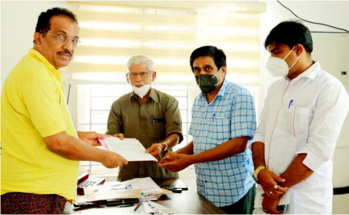
AIBRF delegation handing over memorandum Honorable M P Shri. Benny Behanan