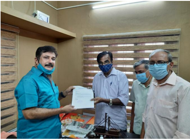
AIBRF delegation handing over memorandum To Hon. M.P. Shri. A.M. Arif