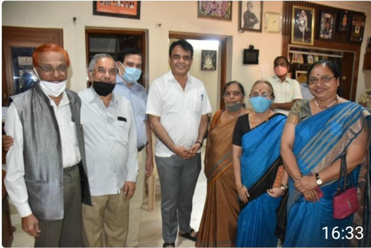
Photo of AIBRF delegation submitting memorandum to Dy. C.M. in Bangalore on 27.12.2020