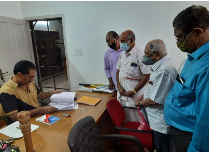
AIBRF delegation handing over memorandum Shri. NK. Premachandran Hon. .MP.