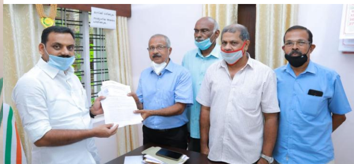
AIBRF delegation handing over memorandum Hon. M.P. Shri. Dean Kuriakose