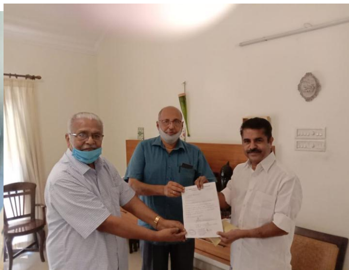
AIBRF delegation handing over memorandum Hon. M.P. Sri. ADOOR PRAKASH MP(Aattingal)