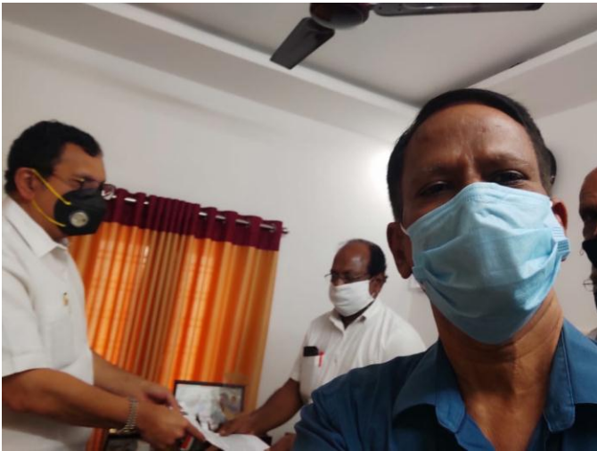
AIBRF delegation handing over memorandum Hon. M.P. K. Murleedharana