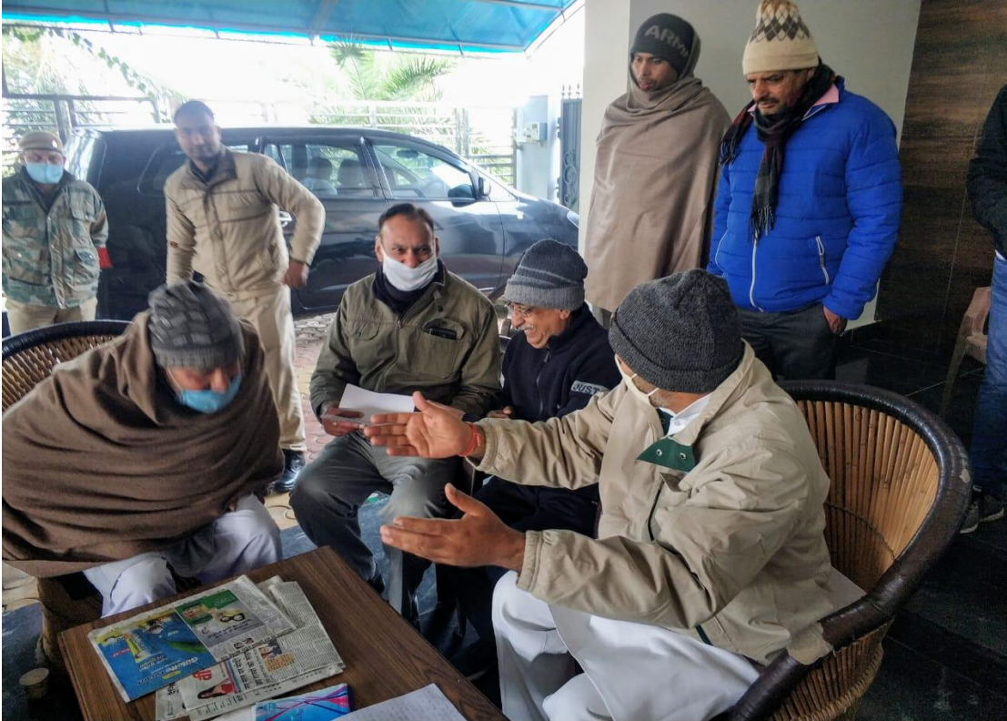
Photo of AIBRF delegation meeting the honorable Minister in Muzzafar Nagar (U.P.) on 02.1.2021