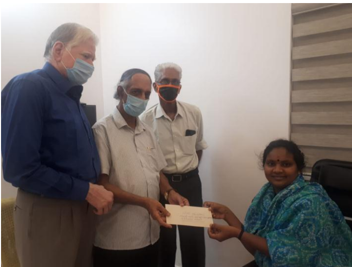
AIBRF delegation handing over memorandum Hon. M.P. Smt. Ramya Haridas.