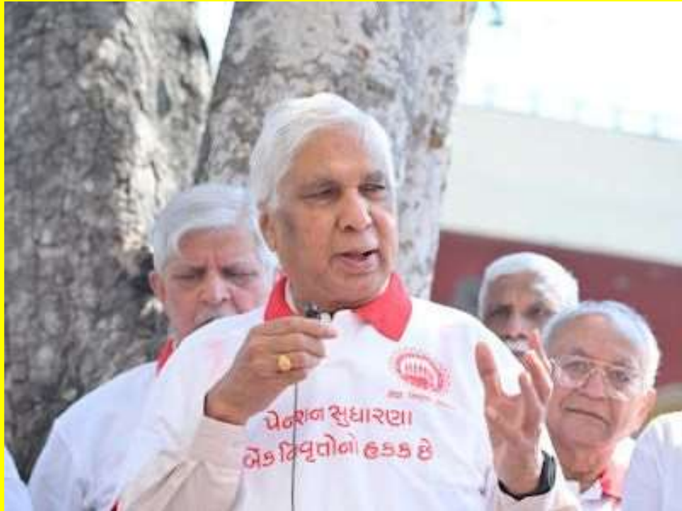
Retiree Leaders from Gujarat sitting on Dharna program on 19.03.2025