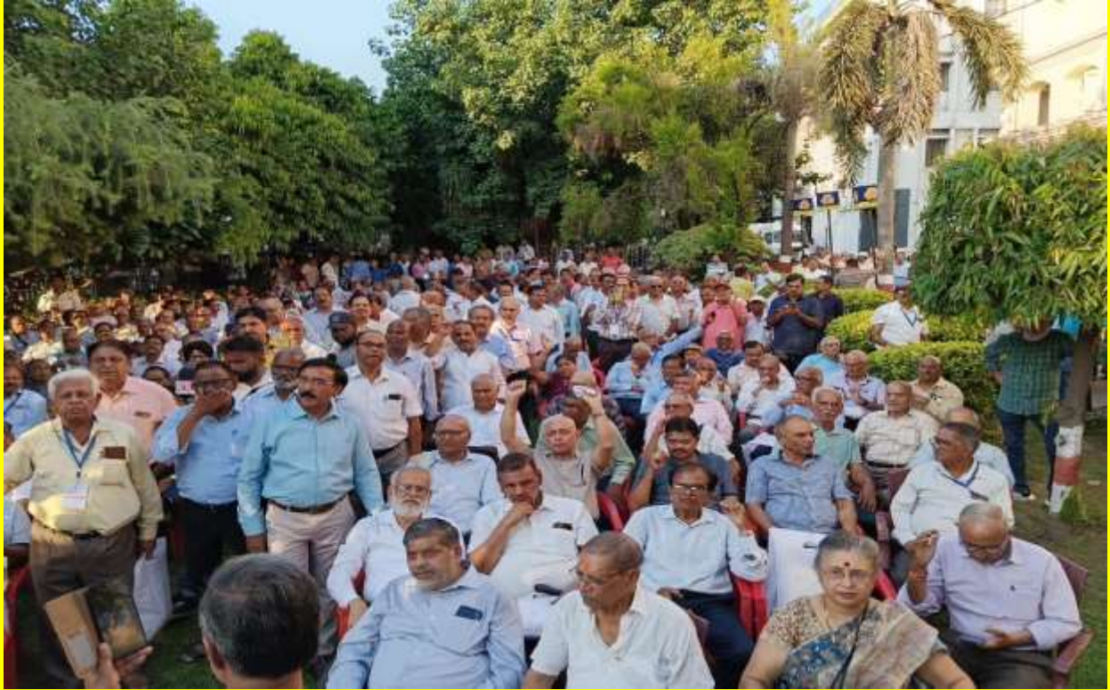
Leaders addressing Dharna Program at Lucknow