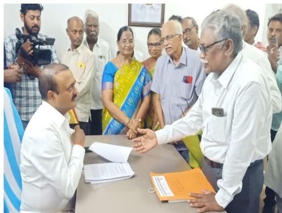
Shri Bala Showry – MP Machilipatnam