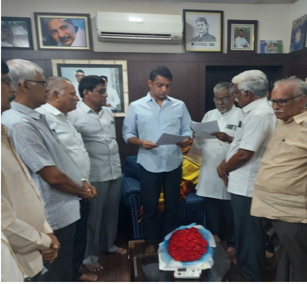
Shri K. Sridhar – MP Eluru