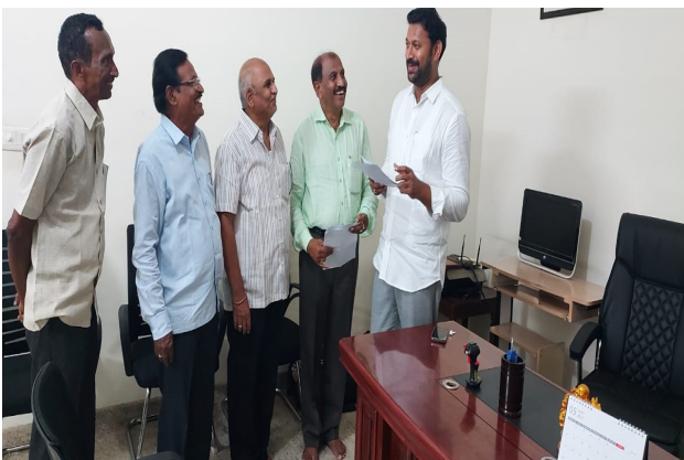
Shri Y S Avinash Reddy – MP Kadapa