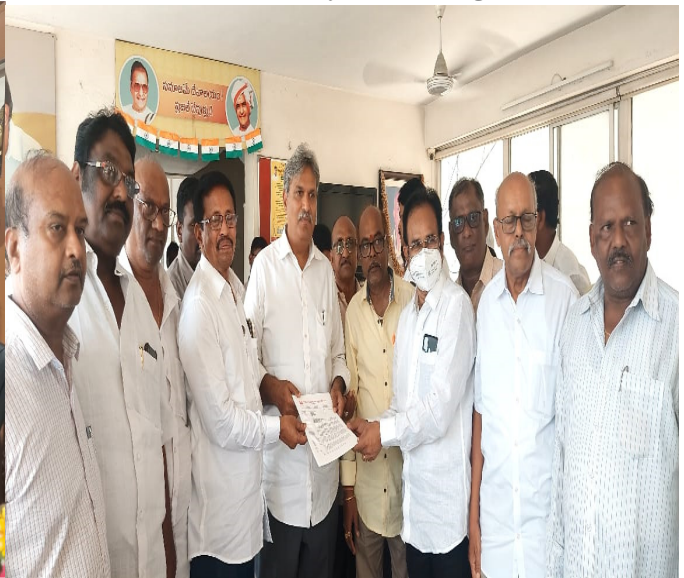
Shri Kesineni Srinivas – MP Vijayawada