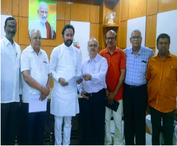
Shri. G. Kishan Reddy – Tourism Minister

Photos of the delegations submitting the Memorandum to honorable M.Ps. are reproduced below. We also append below letters written by some of the above honorable Members of the Parliament to the Finance Ministers with the request to consider demand of updation favorably.