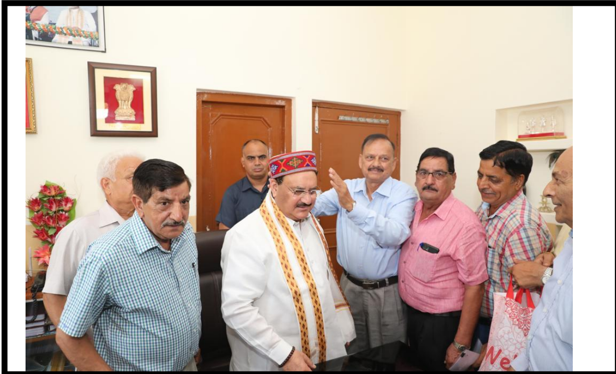
Photo of AIBRF delegation from North West State Committee honoring BJP All India President Shri J.P. Nadda and submitting Memorandum on Updation in Hamirpur on 14.06.2023

Core Committee Meeting Held on 24.06.2023 through Video Conferencing to discuss and decide on issue of Updation of Pension and improvement in Group Medical Insurance Scheme