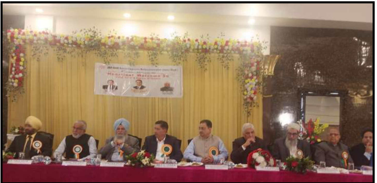
General Secretary Addressing Conference of J & K Welfare Association in Jammu

Guests sitting on the Dias including MD of J & K Bank.