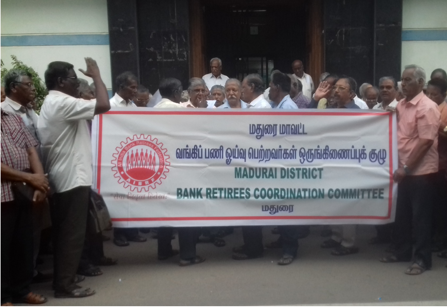
Demonstration at Madurai on 31.07.2019 organized by Madurai District Committee of Tamilnadu State Committee.