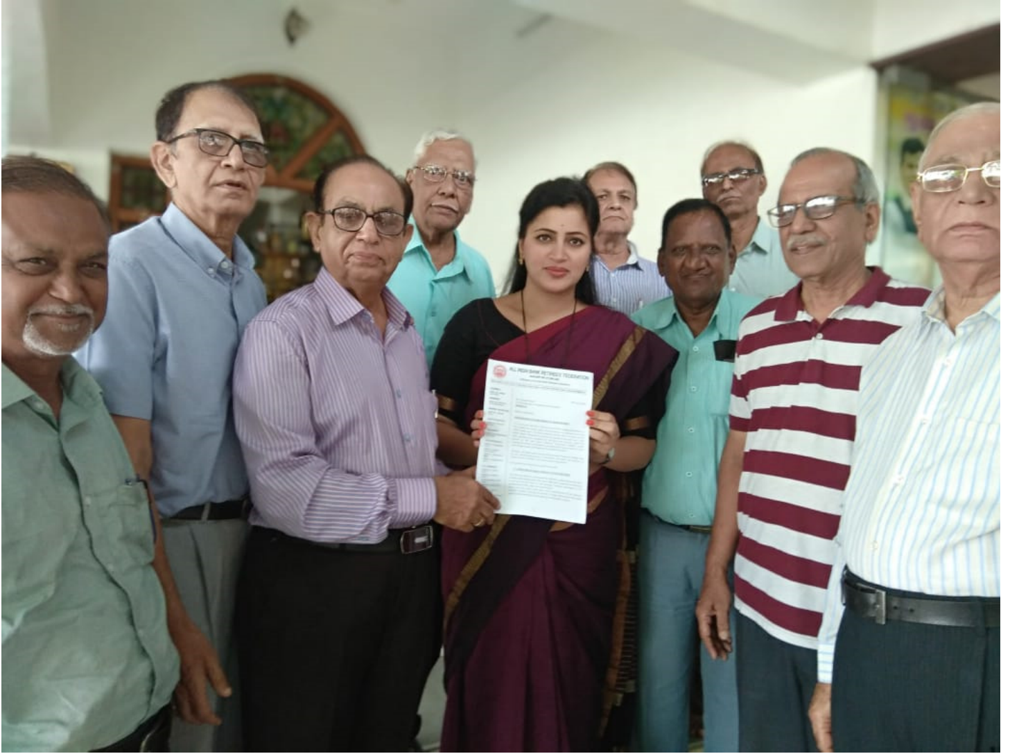
AIBRF DELEGATION FROM NAGPUR SUBMITTING MEMORANDUM ON PENDING ISSUES OF RETIREES TO HONOURABLE MEMBER OF PARLIAMENT (LOK SABHA) MRS NAVNEET RANA FROM AMRAVATI (MAH..) CONSTITUENCY.