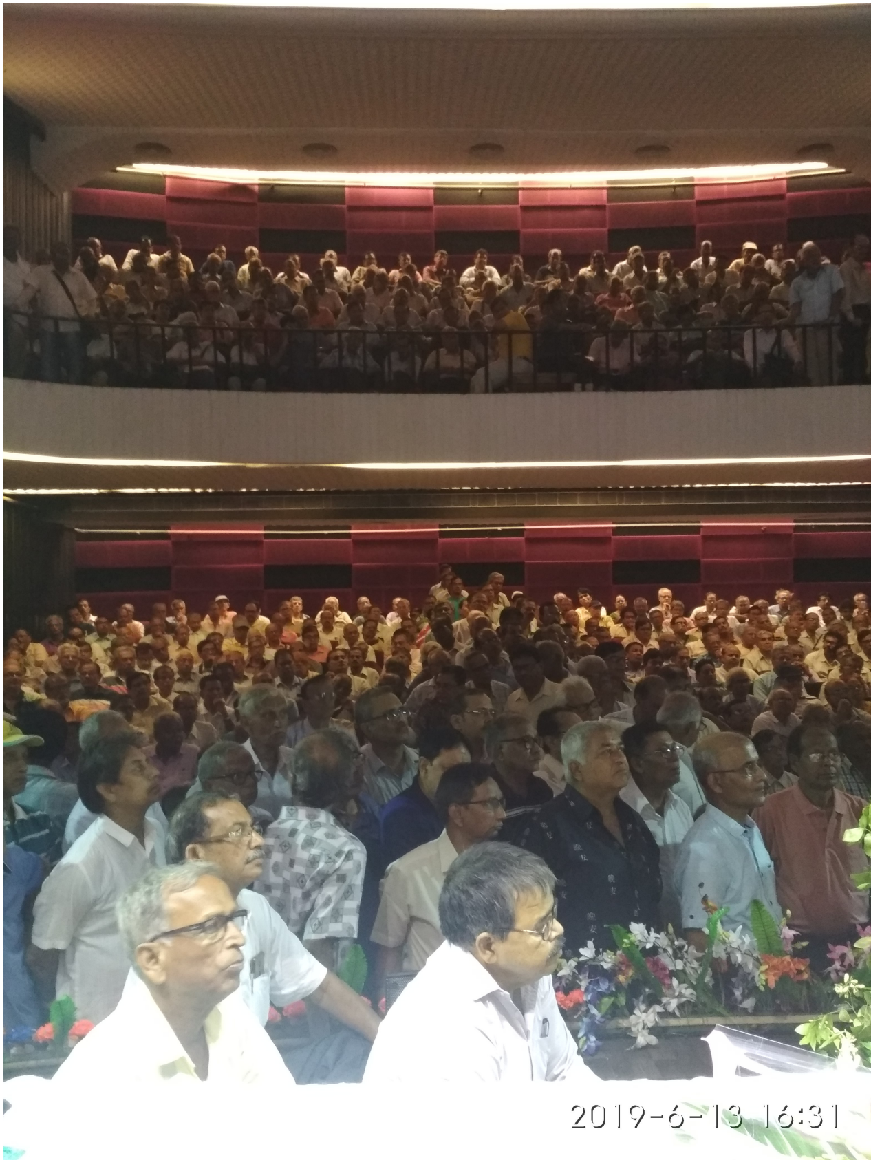
Massive Gathering of Retirees in Kolkata in the meeting organized by Bengal Provincial State Committee on 13,06,2019