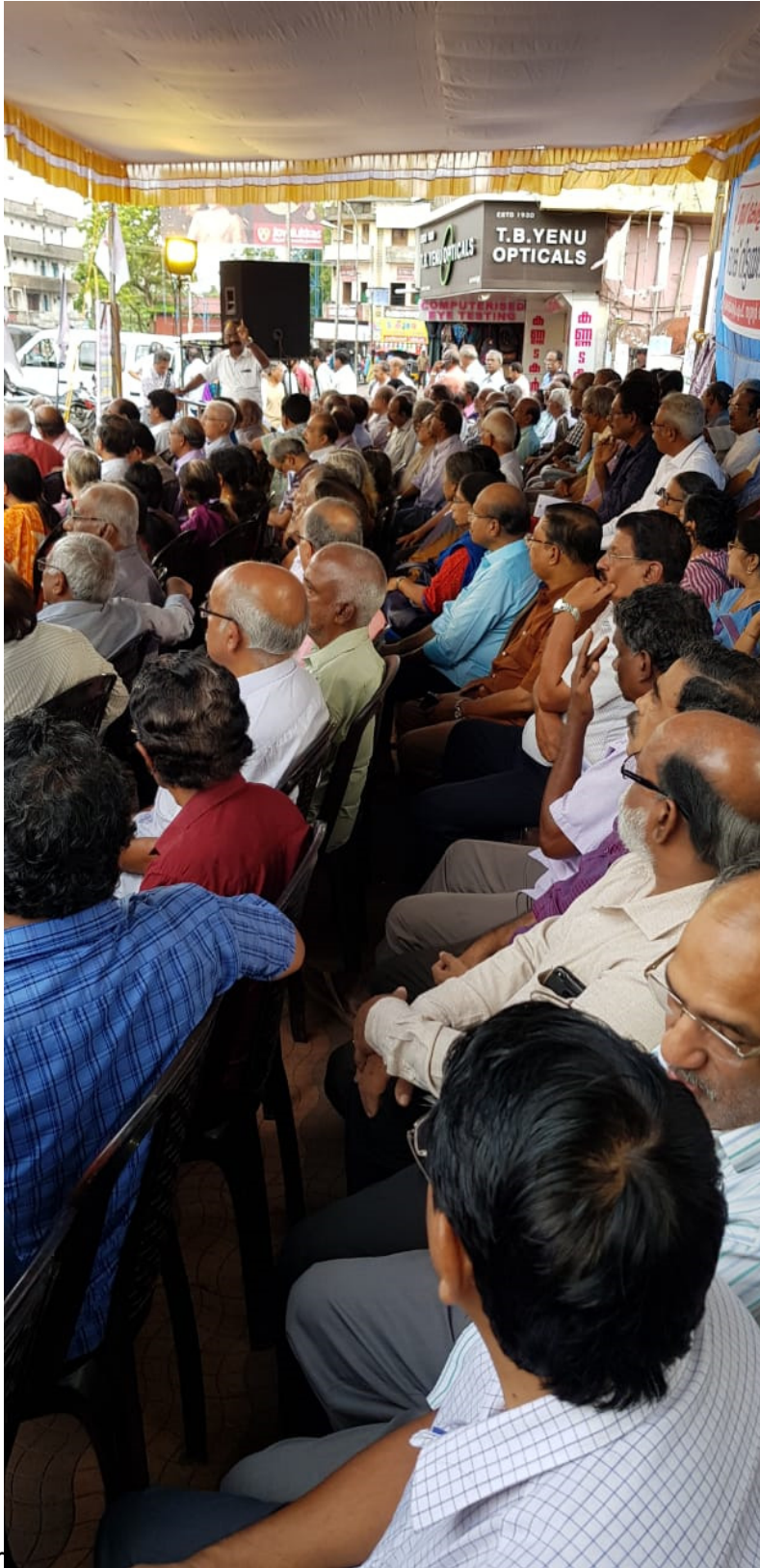
Demonstration organized by AKBRF in Kerala