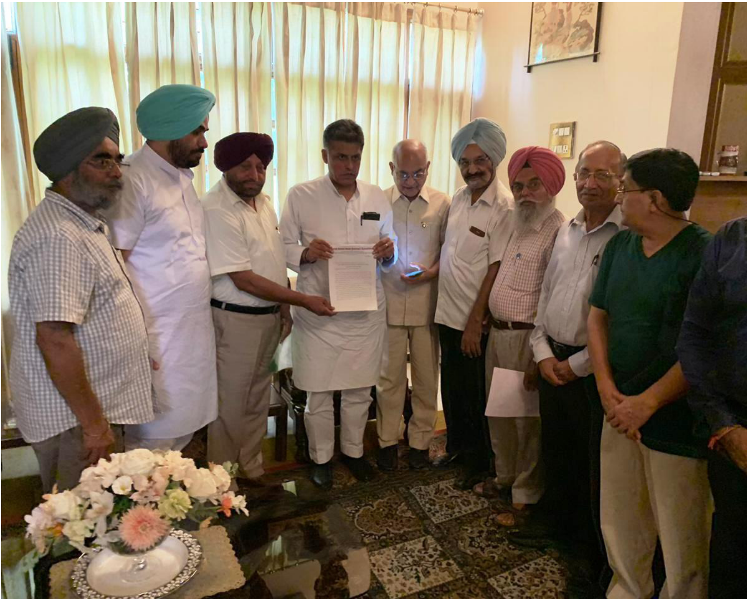
Photo submitting the memorandum to the Member of Parliament.

He assured the delegation that he would study the memorandum and arise bank retiree issues in Parliament.