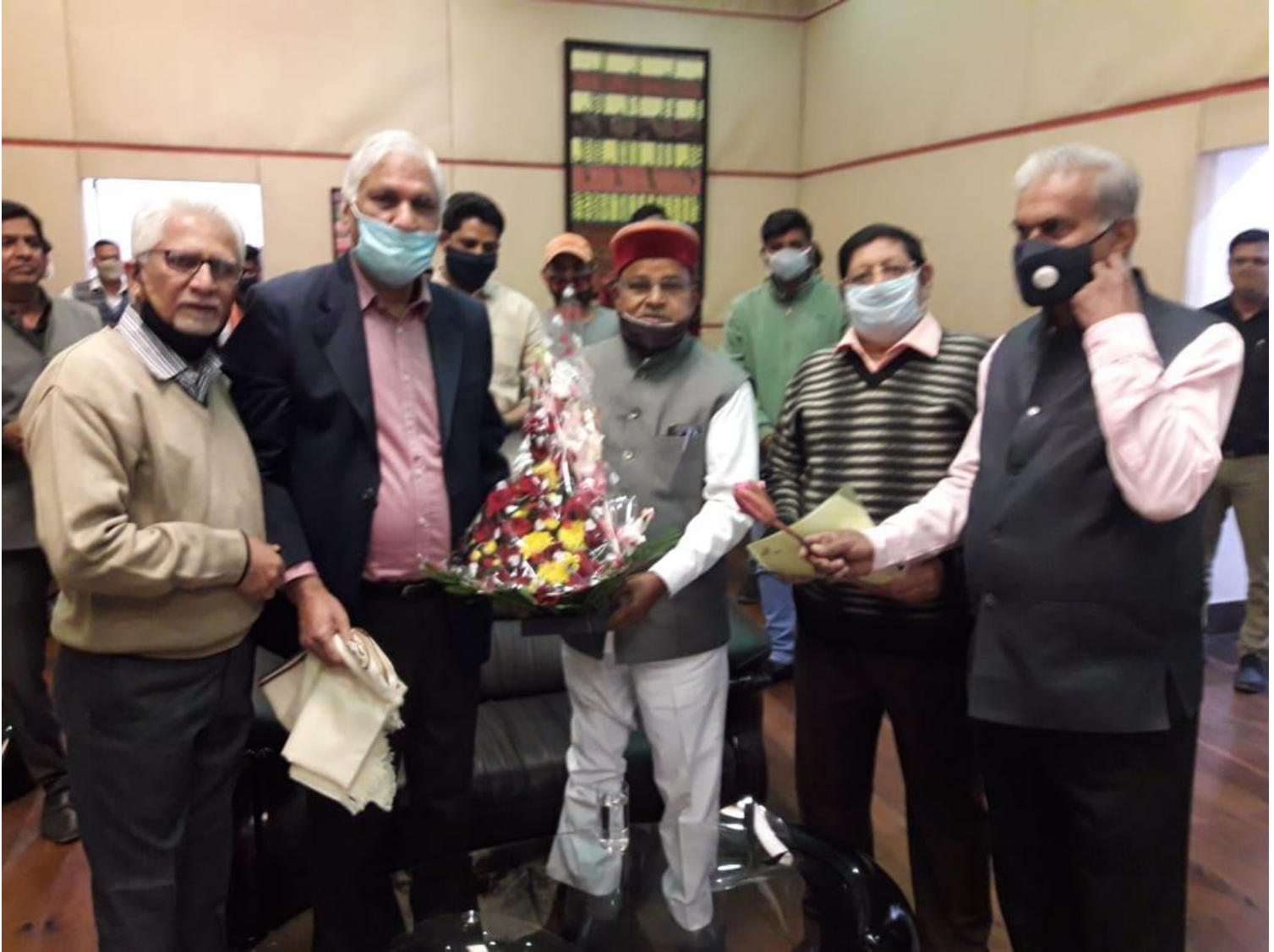
Photo of AIBRF delegation meeting the Central Cabinet Minister Shri Thawar Chand Gehlot on 24.12.2020

Advice/ Instructions to State Committees /Affiliates for continuance of follow up programs at various centers in coming days.