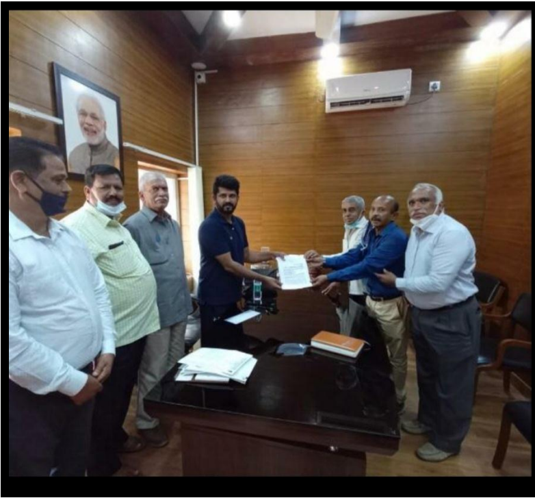
8. : AIBRF, Mysore Dist. Committee Presenting the Memorandum on Bank Retirees issues, on 15/01/2021 at Mysuru, to Mr. Srinivasa Prasad, M P from Chamarajanagara