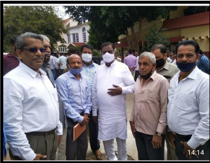
.9. 18/1/2021 : Davanagere Chitradurga District Bank Retirees Federation Representatives met Honorable Parliament member Sri. G.M.Siddeshwara Davangere Constituency at his guest house and submitted a memorandum on our pension updation, and for immediate clearance of family pension and other issues