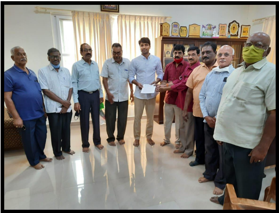
6. AIBRF delegation from Andhra State Committee submitted memorandum to Honorable Member of Parliament & Chair Person Parliamentary Committee Shri Prakash Jadhav at Tirupathi on 20.01.21