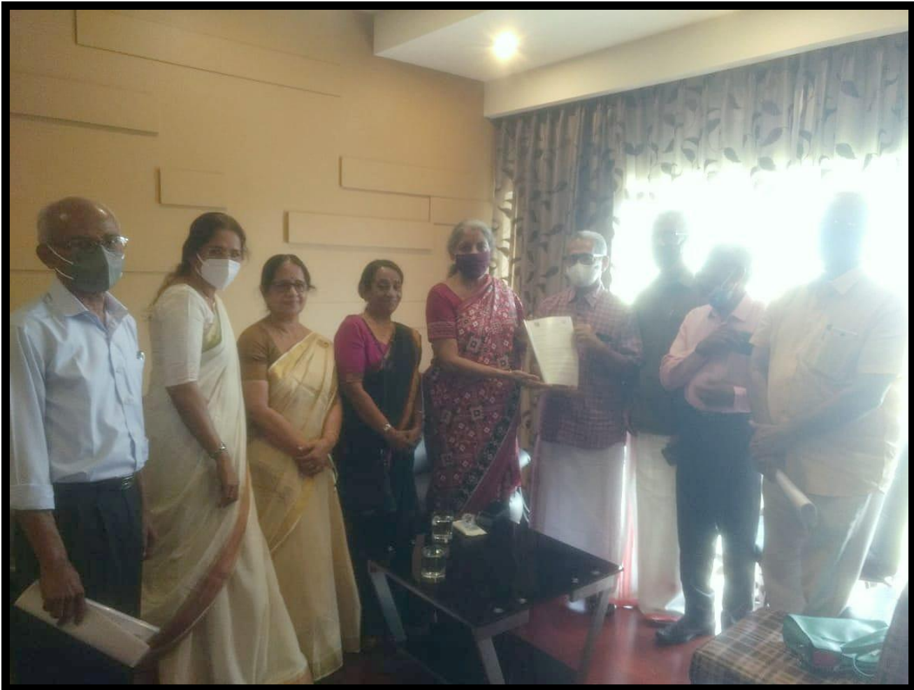
PHOTO OF DELEGATION SUBMITTING MEMORANDUM TO HON. FM IN COCHIN ON 28.02.2021