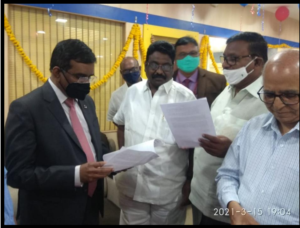
Photo of AIBRF delegation submitting memorandum to IBA Chairman in Vijayawada on 15.03.21