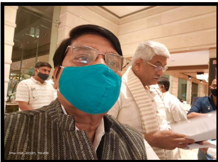
Photo of AIBRF delegation submitting memorandum to the honorable Minister