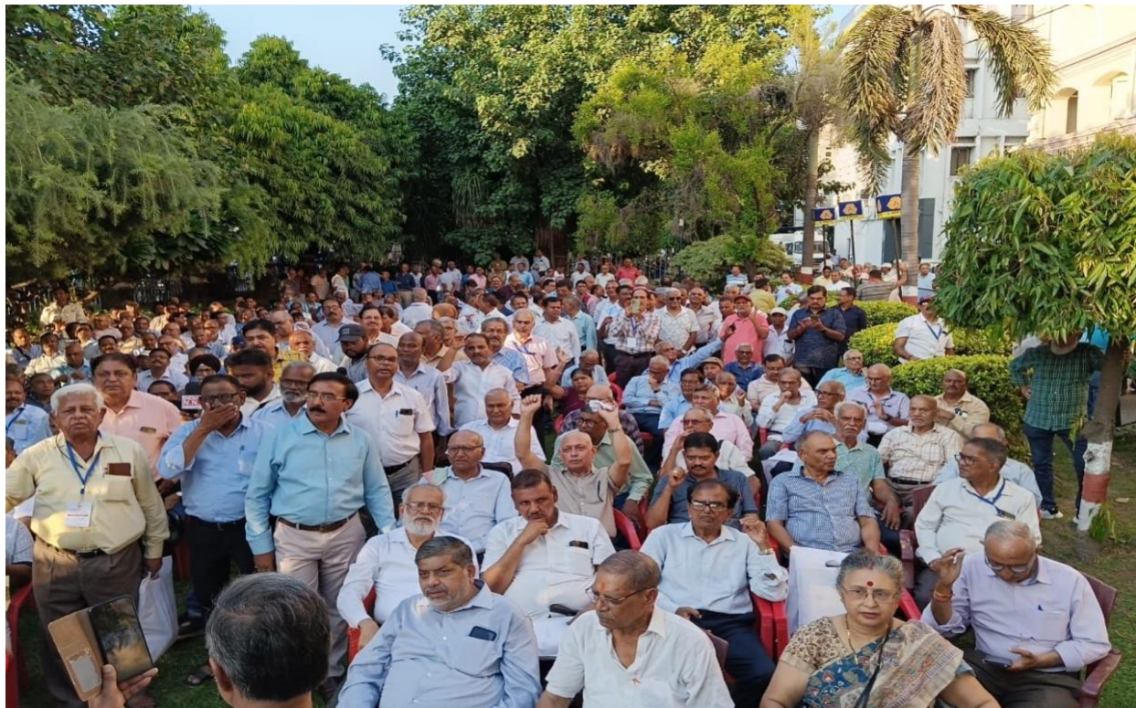
Gathering at Dharna program at Lucknow